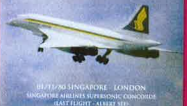
Singapore / London, Singapore Airlines on 1 Nov 1980 - Albert See