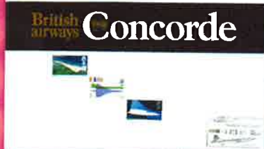
7 Feb 1981, Concorde charter flight London / Atlantic Ocean supersonic soaring in the air with 100 paxs